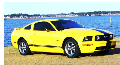
David's 2006 GT Coupe