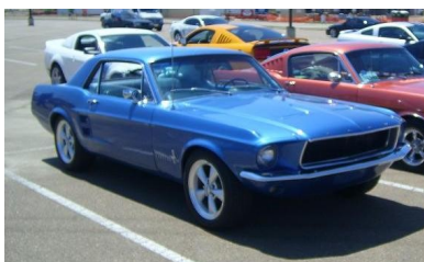
Joe's 1967 Coupe